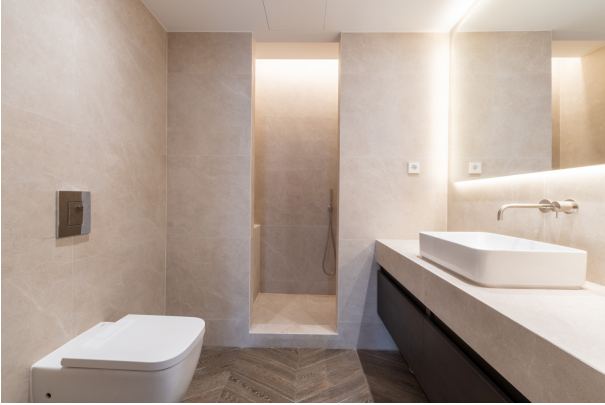
Toledo 4, Madrid-9