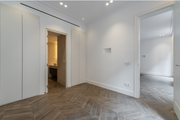
Toledo 4, Madrid-7