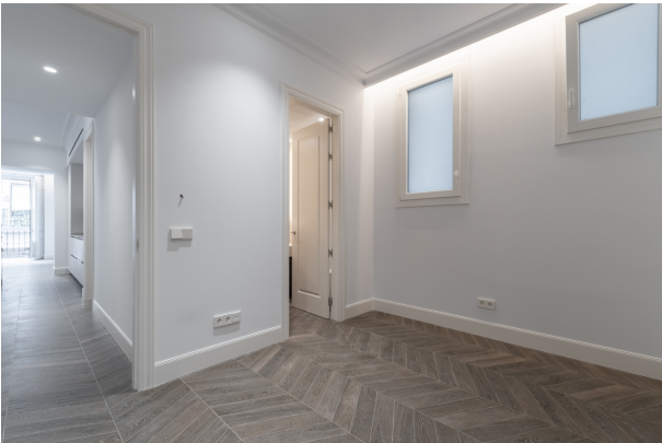
Toledo 4, Madrid-4