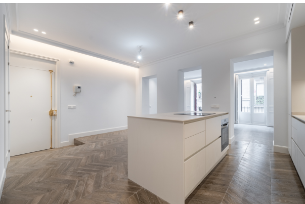
Toledo 4, Madrid-15