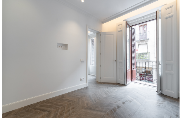
Toledo 4, Madrid-8