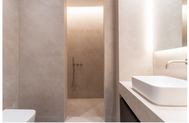
Toledo 4, Madrid-5