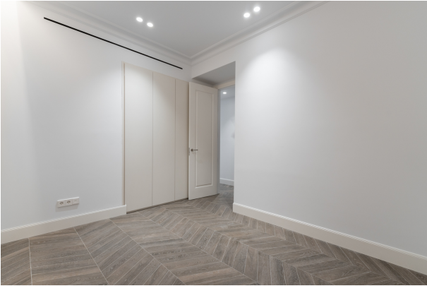
Toledo 4, Madrid-3