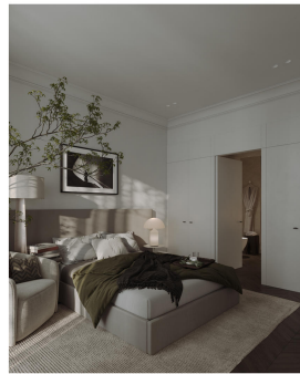
Dormitorio ppal 02