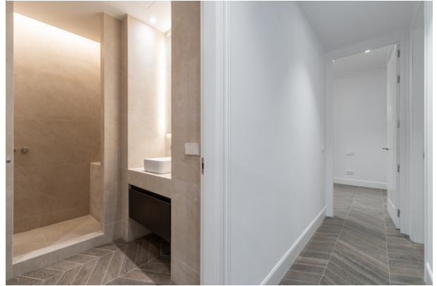
Toledo 4, Madrid-6