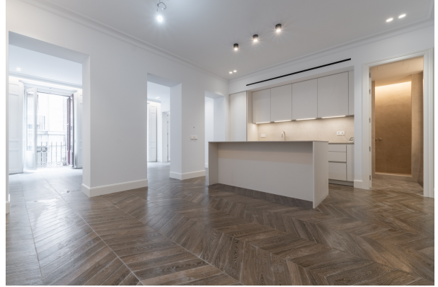
Toledo 4, Madrid-12