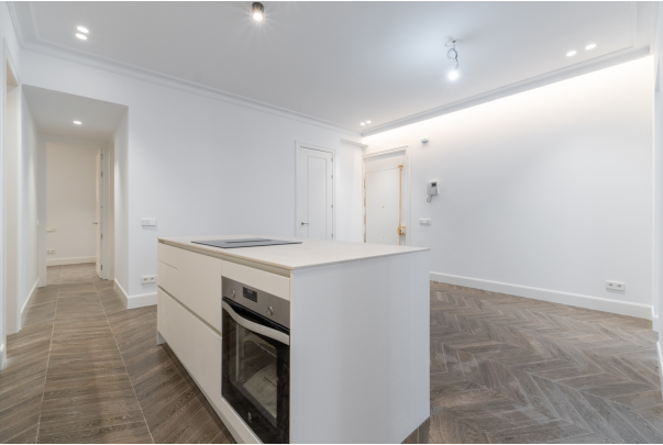
Toledo 4, Madrid-13