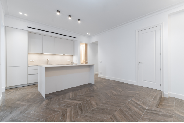
Toledo 4, Madrid-11